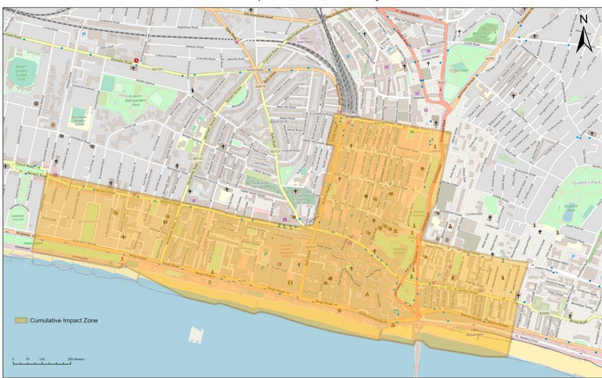
Cumulative Impact Zone, January 2021

3.1.4 This special policy will refer to a Cumulative Impact Zone ("the CIZ") in the Brighton city centre, a detailed plan of which is shown below.